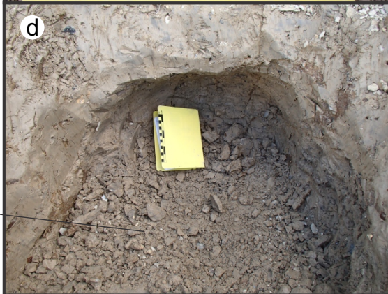
Figure 30: Photos of sediments present at section 15112TH118: a) river-view of the river cut exposing sediments; b) till exposed at 0.75 m depth; c) till exposed at 1.8 m depth; d) till exposed at 4.0 m depth.